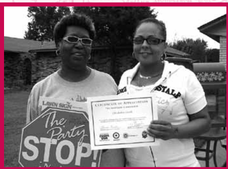
Organizers from Chisholm Creek with their Certificate of Participation

Final Registration for NNO events. Register your neighborhood event to be included on the Neighborhood Alliance Master List, distributed to Police, Fire, County and City agencies. A representative from Neighborhood Alliance will visit your event and present a certificate of participation!